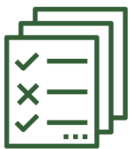
Figure 1: Examples of Australian regulatory instruments relating to consumer vulnerability

In Australia to date, vulnerability strategies have been pursued through three main mechanisms: legislative and statutory instruments; industry codes of practice; and regulatory guidance. A non-exhaustive list of examples is set out below.